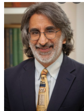
Professor Akhil Reed Amar

Professor Amar is one of Yale's most engaging and dynamic speakers. Akhil Reed Amar is Sterling Professor of Law and Political Science at Yale University, where he teaches constitutional law in both Yale College and Yale Law School. After graduating from Yale College, summa cum laude, in 1980 and from Yale Law School in 1984, and clerking for then Judge (now Justice) Stephen Breyer, Amar joined the Yale faculty in 1985 at the age of 26. He is Yale's only currently active professor to have won the University's unofficial triple crown — the Sterling Chair for scholarship, the DeVane Medal for teaching, and the Lamar Award for alumni service.