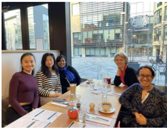
Mountain Day October 2022