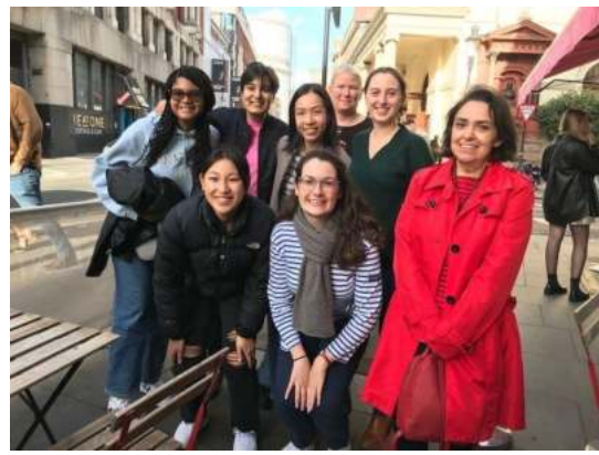
Mountain Day October 2022