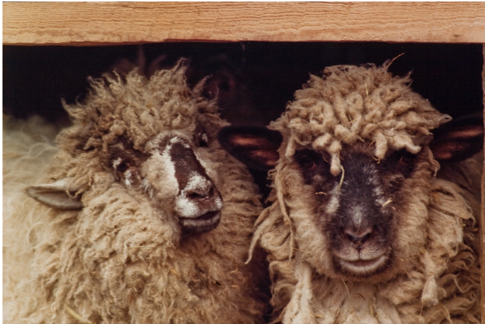
Don't believe everything that is whispered or tweeted at 3am.