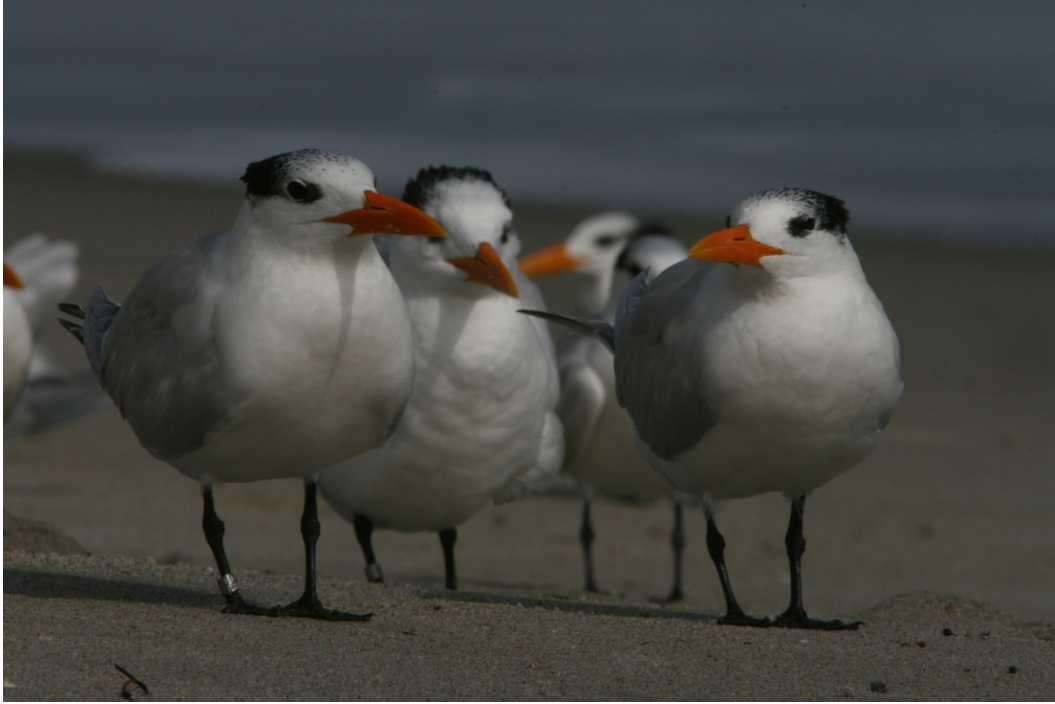
Talk it over with your friends...